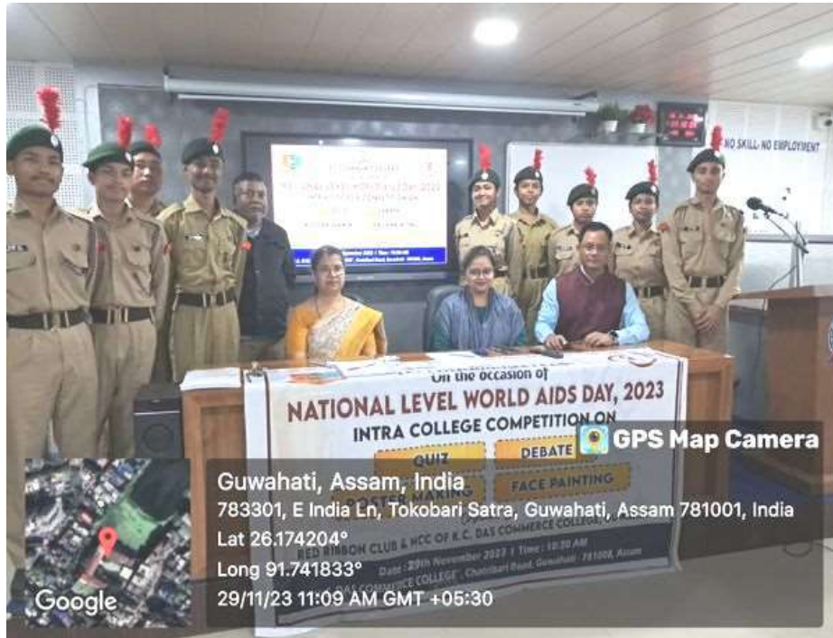
Intra-College Competition on the occasion of World AIDS Day