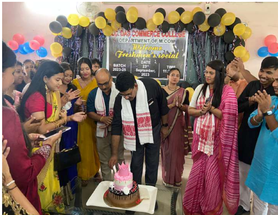
Celebration of Freshmen Social by the Dept. of M. Com.