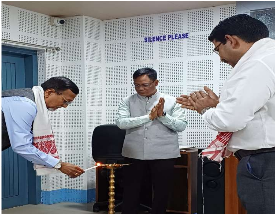
One day Awareness Program (EAP) sponsored by Office of the Development Commissioner (MSME), Government of India and implemented by Indian Institute of Entrepreneurship (IIE), Guwahati