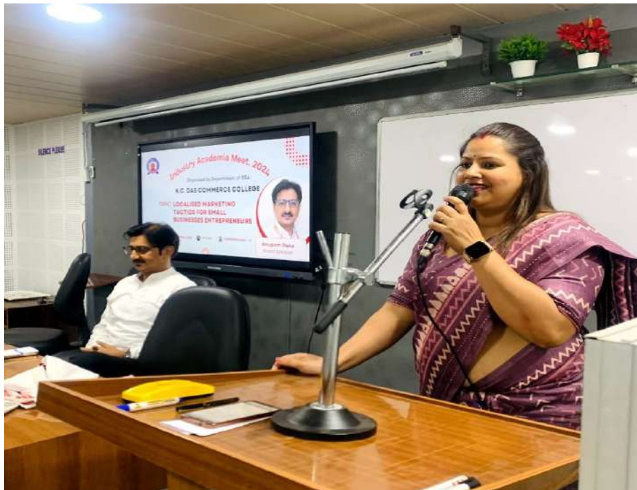
Industry Academia Meet organized by the Department of BBA