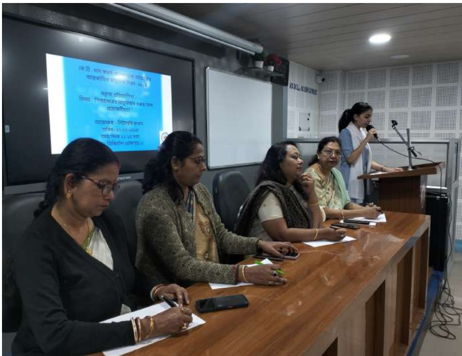
Celebration of International Mother Language Day organized by K. C. Das Commerce College Literary Forum