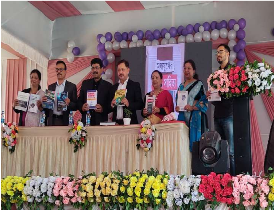
Inauguration of Books Written by Faculties under NEP-2020