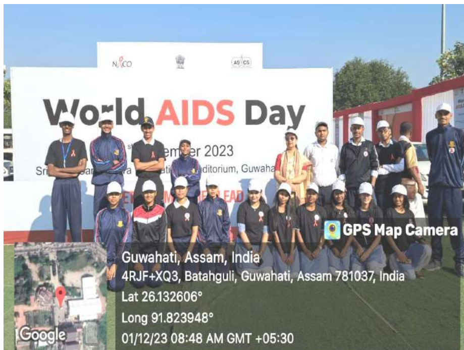
Students' participation on the occasion of World AIDS Day-2023