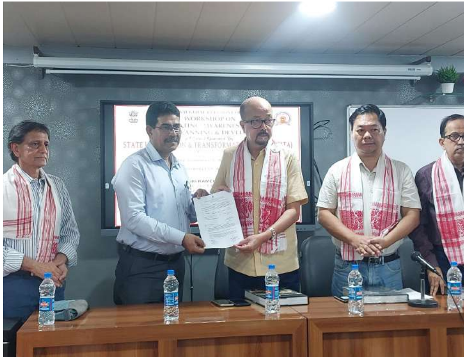
Signing of MOA between SITA and K. C. Das Commerce College