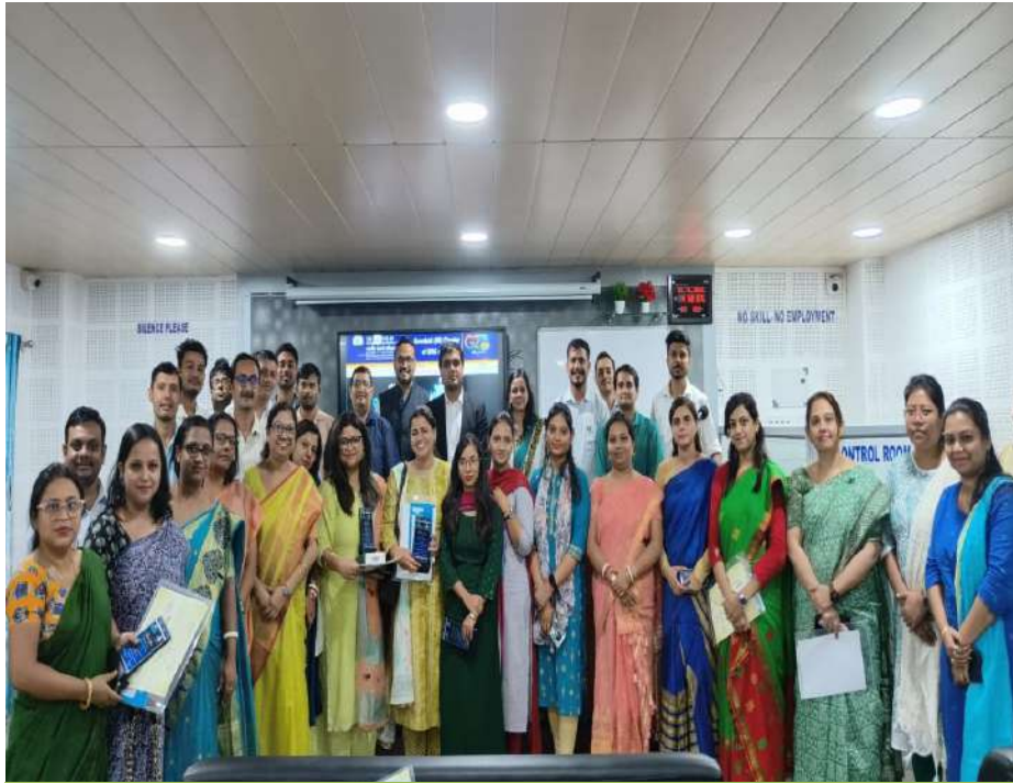
Awareness Programme on Company Secretary Course