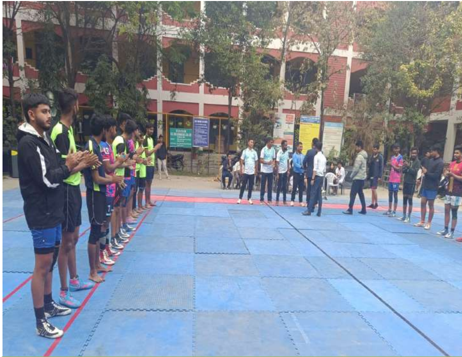
Inter-College Kabaddi Competition