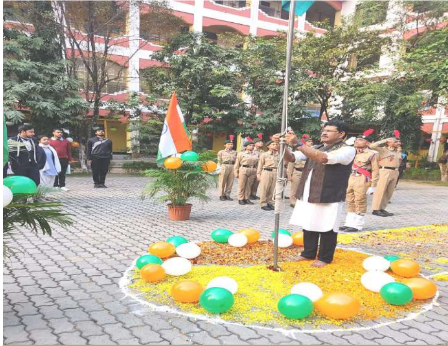
Republic Day Celebration