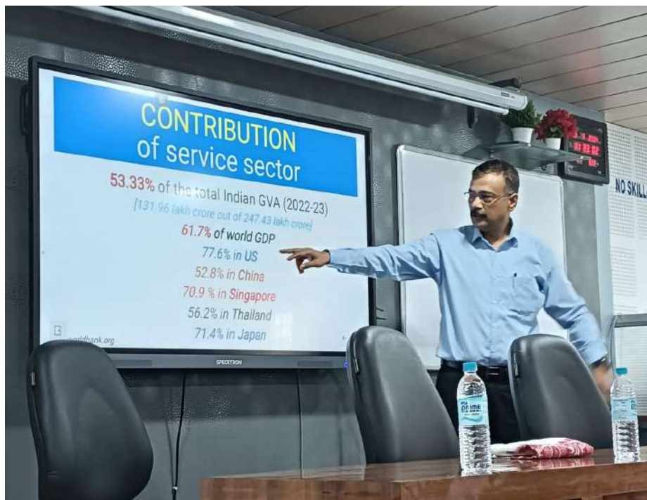
One day workshop on 'The Flower of Services: Blooming everywhere and Shining All' organised by the Department of Management, in association with IQAC