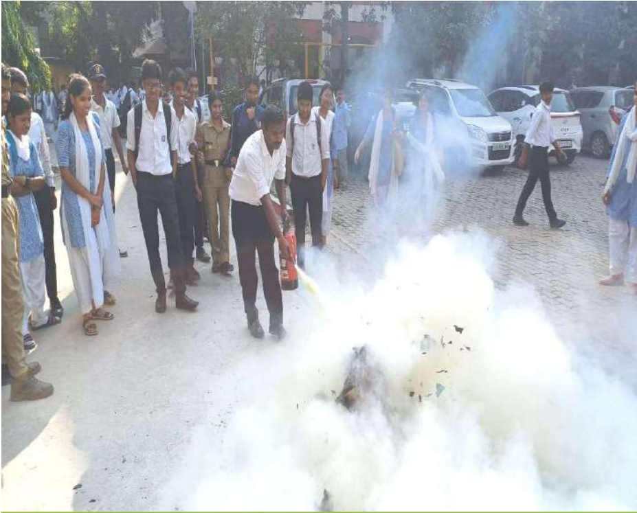
Training on the use of Fire Extinguisher