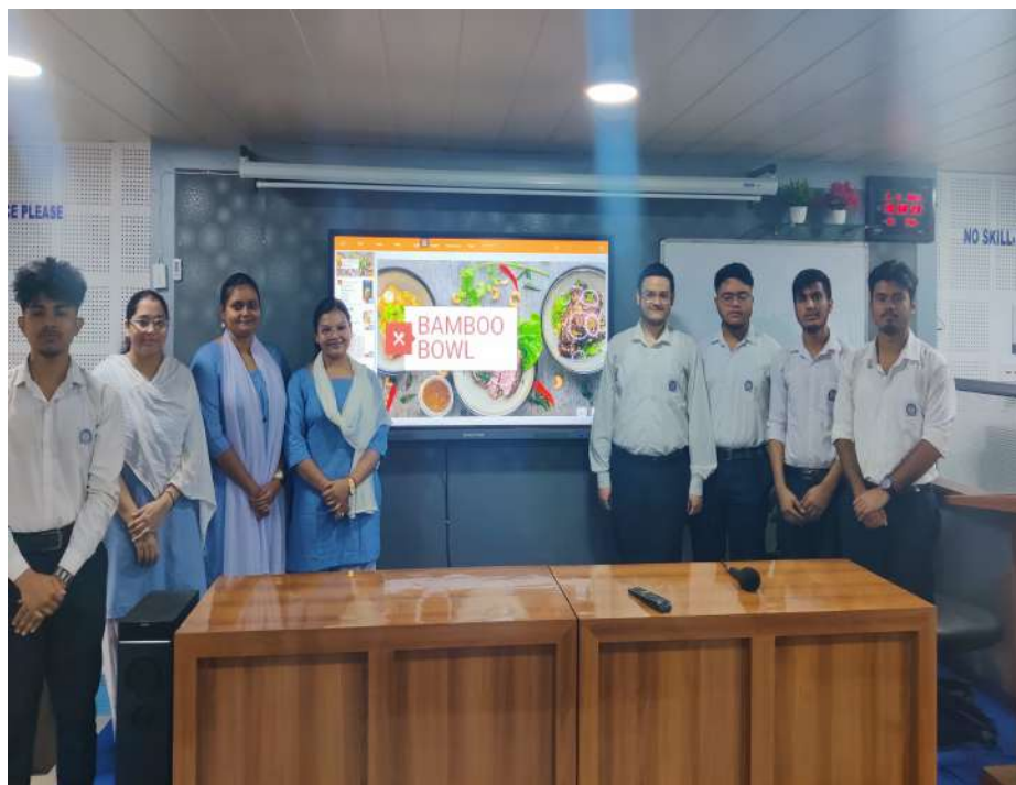
PPT Presentation on Entrepreneurship by B.Com. 3 rd Semester Students