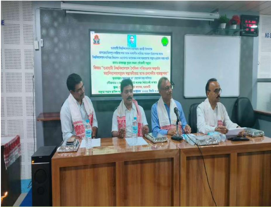
9th Prasannamalla Bujar Baruah Memorial Lecture organised by K. C. Das Commerce College Literary Forum