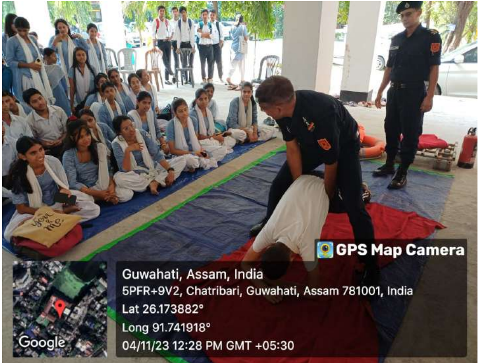
A Disaster Awareness Training programme conducted by Civil Defence, Kamrup Metro District on how to respond to disaster situations