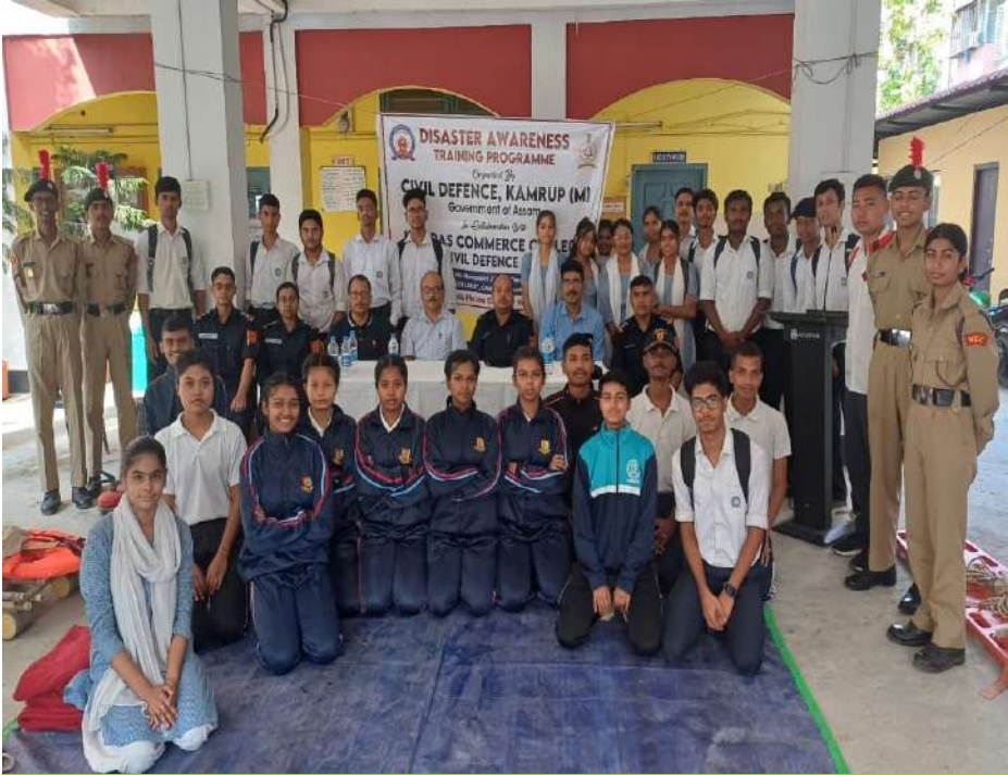
Disaster Awareness Training Programme