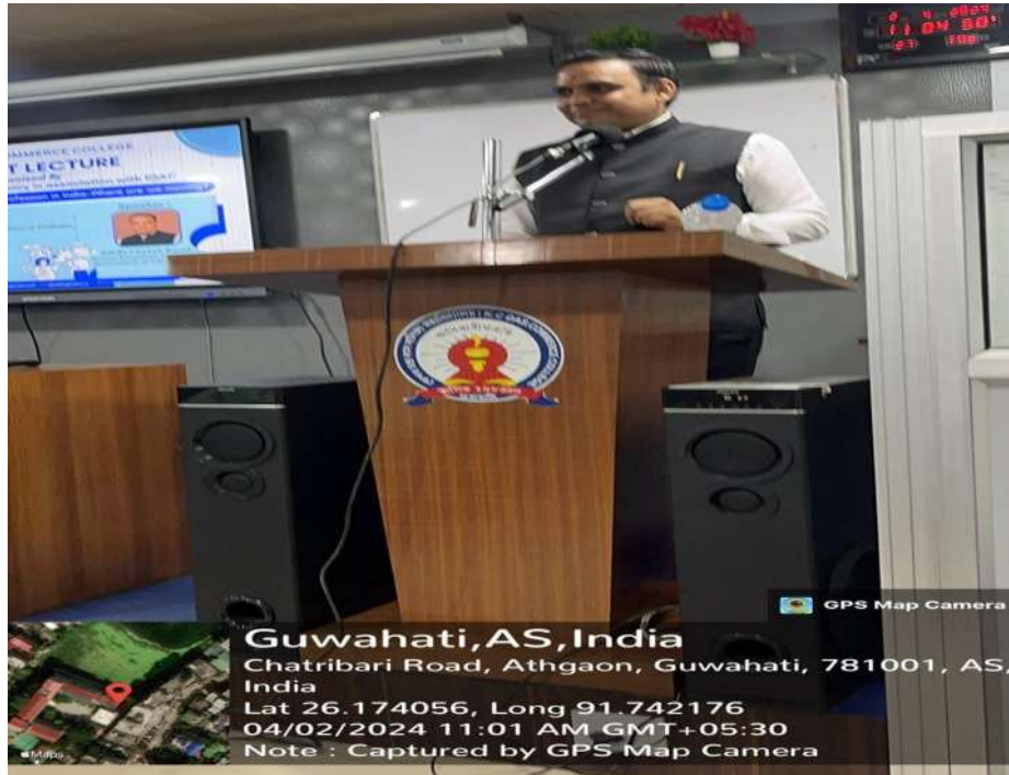
Guest Lecture on “Future of Accounting Profession in India-Where are we moving?” organized by the Department of Accountancy